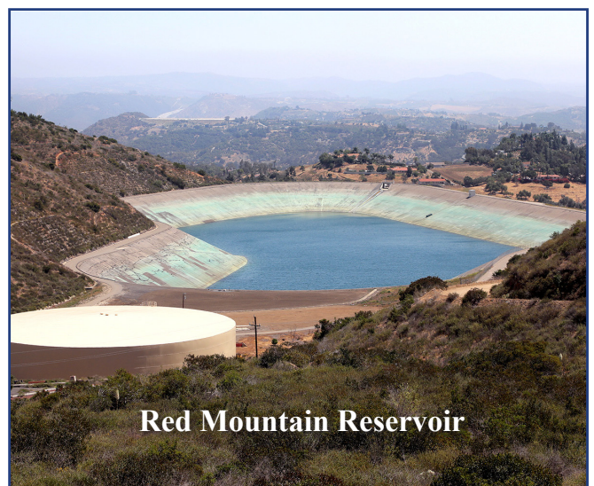
Red Mountain Reservoir

💧 The water the District purchases from the Water Authority is a blend of fully-treated Colorado River and State Water Project water that receives complete conventional treatment, along with ozone treatment – a cutting-edge, high-quality disinfection process. The water is treated at Metropolitan Water District's Skinner Filtration Plant. The water delivered to Red Mountain has a chloramine (mixture of chlorine and ammonia) disinfectant residual.